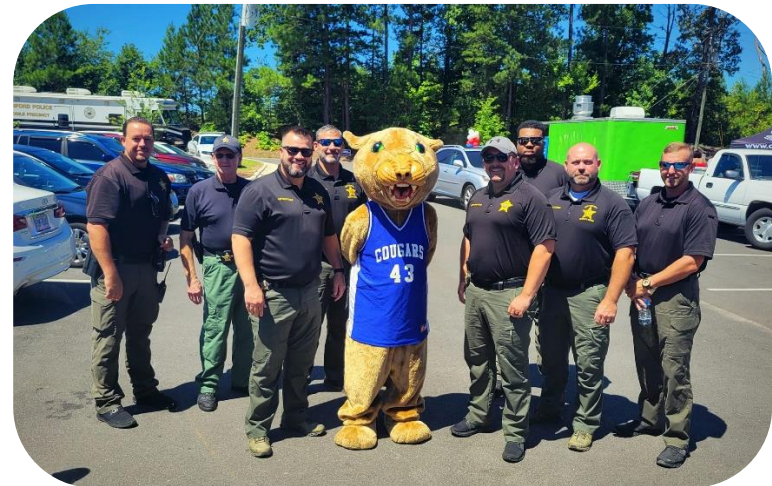
Sheriff's Office supporting Back-to-School Celebrations

The protection of all Lee County Residents is vital for our success as a community, and it requires many County departments to work in tandem. For us in law enforcement, we strive to prevent crime in our communities through responsible policing, school programming, and targeted programs to address pertinent issues in our community, such as the opioid crisis. Our office has expanded our patrol division and implemented the use of Body Worn Cameras in the past few years, two steps necessary to increase safety in Lee County.