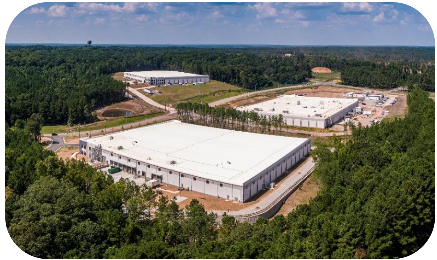
Shell Buildings at Central Carolina Enterprise Park

We are seeing thousands of new jobs being announced in our region every year. Four of the top 25 NC Job creating projects of 2021 are right here in Lee County, with Central Carolina Enterprise Park, alone, securing nearly $350 million in new capital investments. Large corporations such as Moen, Pfizer, Coty, Tyson, Caterpillar, Bharat Forge, and Astellas have opened and/or expanded operations in Lee County in just the past few years. This economic growth in Lee County has