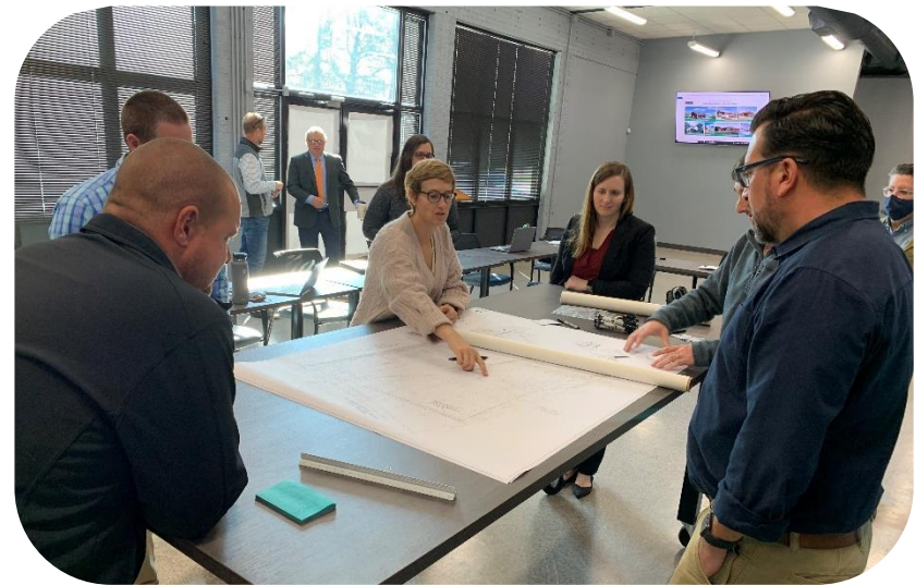
Design session for New Multi Sports Plex

Horton Park, and O.T. Sloan Park have all seen major renovations to include new playground equipment, shelters, basketball, tennis, and pickleball courts. Ramps and crosswalks have also been completed at many County buildings and parks, creating an accessible space for all. In addition to the physical additions, we have expanded our program offerings and seen massive jumps in registrations this year alone. When compared to pre-pandemic, we have seen over 600 more participants so far in 2022.