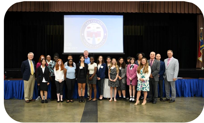
Recognition of 2022 Lee County Young Commissioners

Lee County Website for all official public County meetings, as well as opportunities to take an active part in the governance of Lee County through a number of citizen boards and commissions.