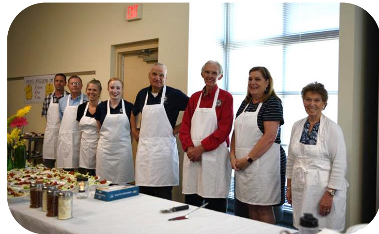
Lee County Employee Appreciation Lunch

To run our programs, Lee County now employs over 400 full time employees and upwards of 2-300 part time employees. Our job training ensures that each employee is provided what they need to succeed in their positions, and we pride ourselves on being a great place to work in our region.