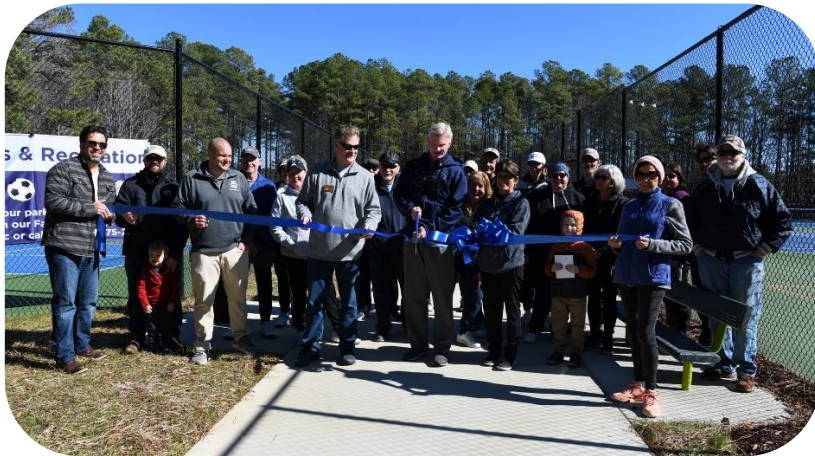
New Tennis & Pickleball Courts at O.T. Sloan Park

Enhancing the parks in Lee County has been a major focus in the past few years. Kiwanis Children's Park, Temple Park,