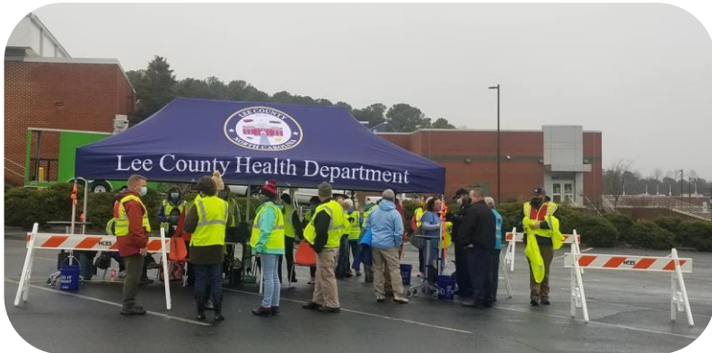
Covid-19 Vaccine Site in January 2021

Regarding the COVID-19 pandemic, we are now seeing cases rise and fall as new variants emerge. Please be aware of your own health and avoid spreading the virus if you find yourself with any associated symptoms. We continue to offer vaccinations, both Pfizer and Moderna, for Lee County residents and are now administering the bivalent booster vaccine to all who are interested in receiving it.