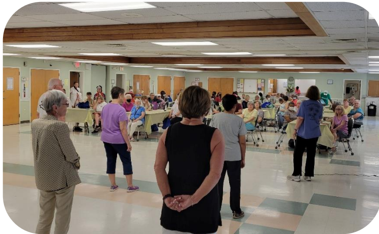
Activities at Lee County Enrichment Center

Our Senior Services and Veteran Services departments have been working to meet the needs of these populations in Lee County. The reopening of the Lee County Enrichment Center has met the demands of over 3000 of Lee County's older adults. Throughout the pandemic, services and programs were maintained, while new offerings such as virtual programming and meal deliveries were expanded.