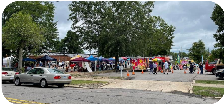
Vendors at 2022 POP!-Con

Our highly anticipated and widely attended POP!-Con was a smashing success a few weeks ago and now we look forward to the installation of a new StoryWalk at the Kiwanis Family Park this fall. We aren't slowing down! The design process of the New Lee County Library is well underway, and we cannot wait for this new project to begin construction near O.T. Sloan Park. The library is a resource for every community member, providing education, enrichment, and enlightenment in all aspects of life. We are proud to serve our residents and look forward to all the future holds for us!