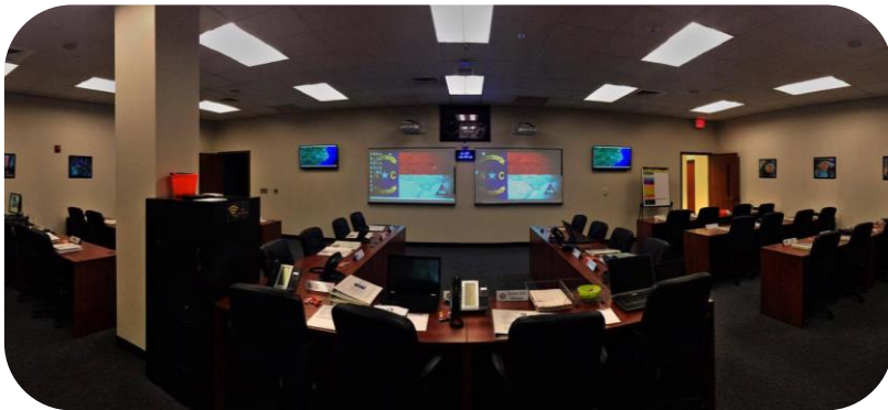
Lee County Emergency Operations Center

Outside of the sheriff's office, there are many other departments working to keep Lee County residents safe and our community clean. Our Emergency Services department has spent the last two years dedicated to the COVID-19 response, providing logistical support, and participating in the management of weekly testing sites and vaccine sites. In the days since the height of COVID-19, Emergency Services has refocused its efforts on planning, preparedness, and community risk reduction.